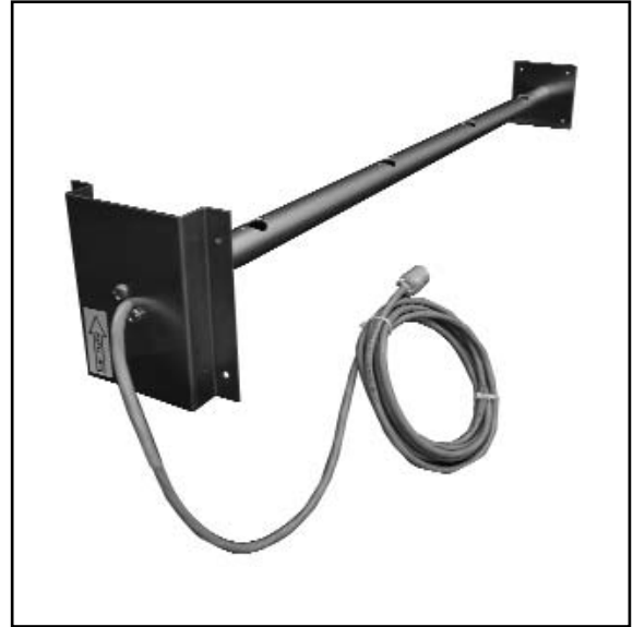
Figure 1. Insertion Mount Probe

This document provides the instructions necessary to install Standard insertion mount probes as shown in Figure 1. Insertion mount probes are installed externally through the sidewall of the duct/plenum. Installation consists of marking and preparing the mounting holes and then installing and securing the probes. For detailed probe information, refer to the Duct/Plenum Probe technical manual under separate cover. For detailed information on transmitter set up and operation of the complete airflow measurement station, refer to the associated transmitter technical manual (under separate cover). Observe the following precautions during installation: